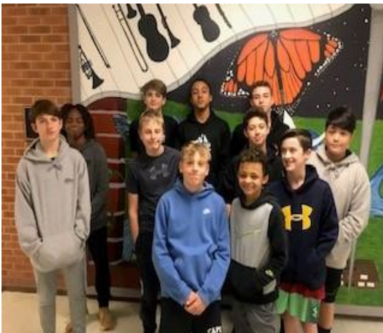
7th Grade County Champs