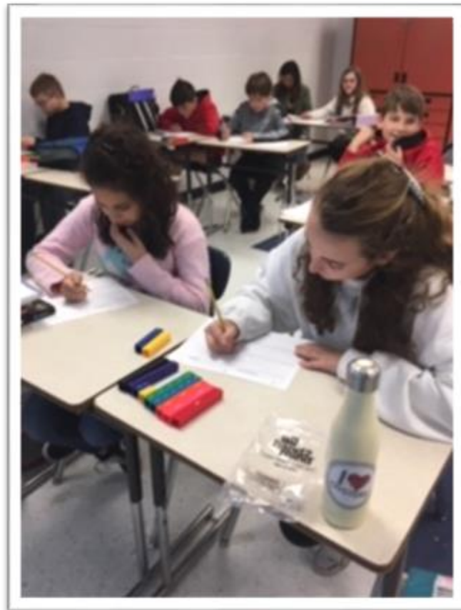
Students in Mrs. Plitt's math class model fraction division with fraction towers.