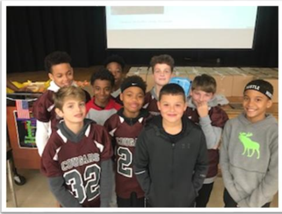
6th Grade County Champs